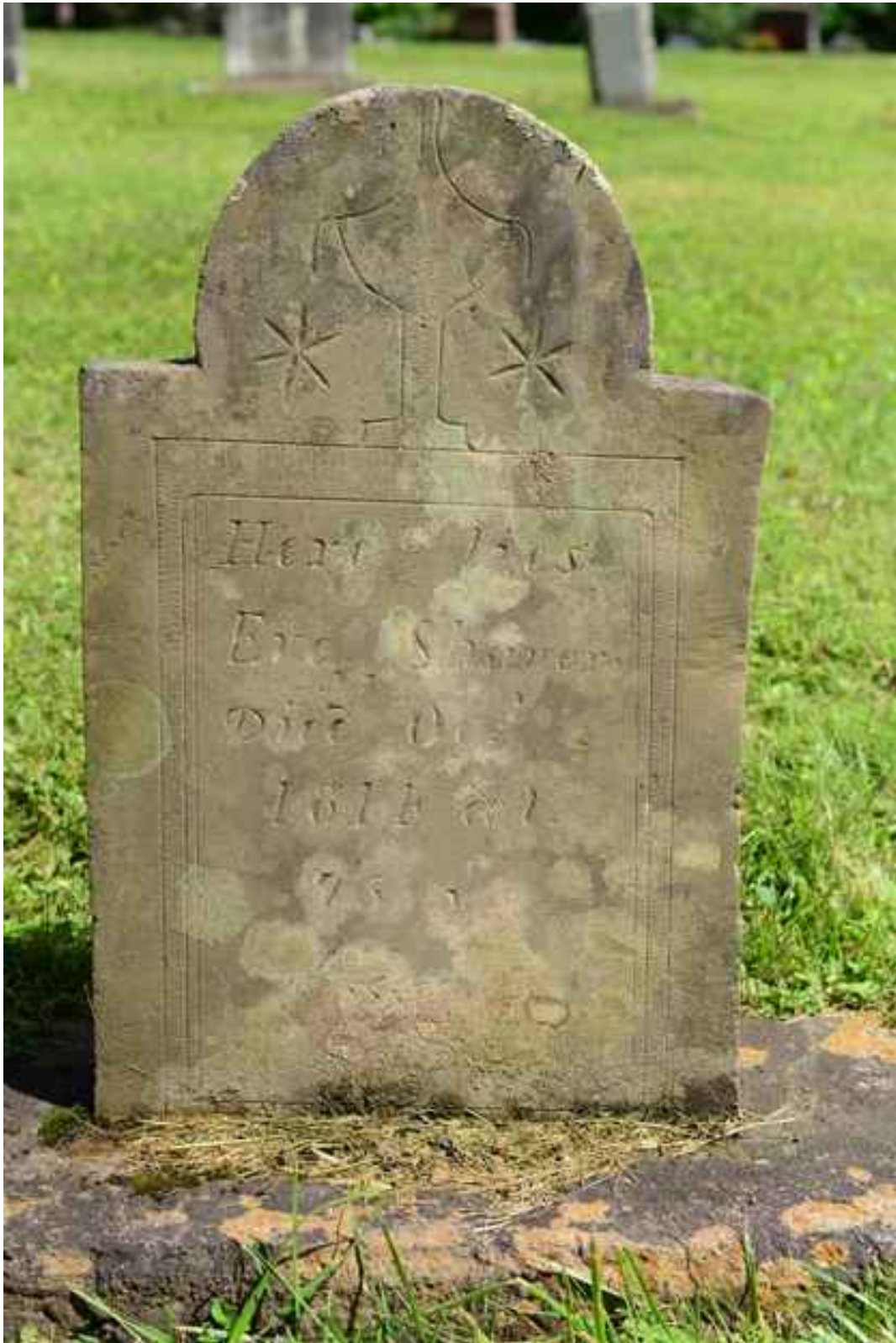
Figure 5, Gravestone of Eva (Sickner) Shaver in the new Shavertown Cemetery.