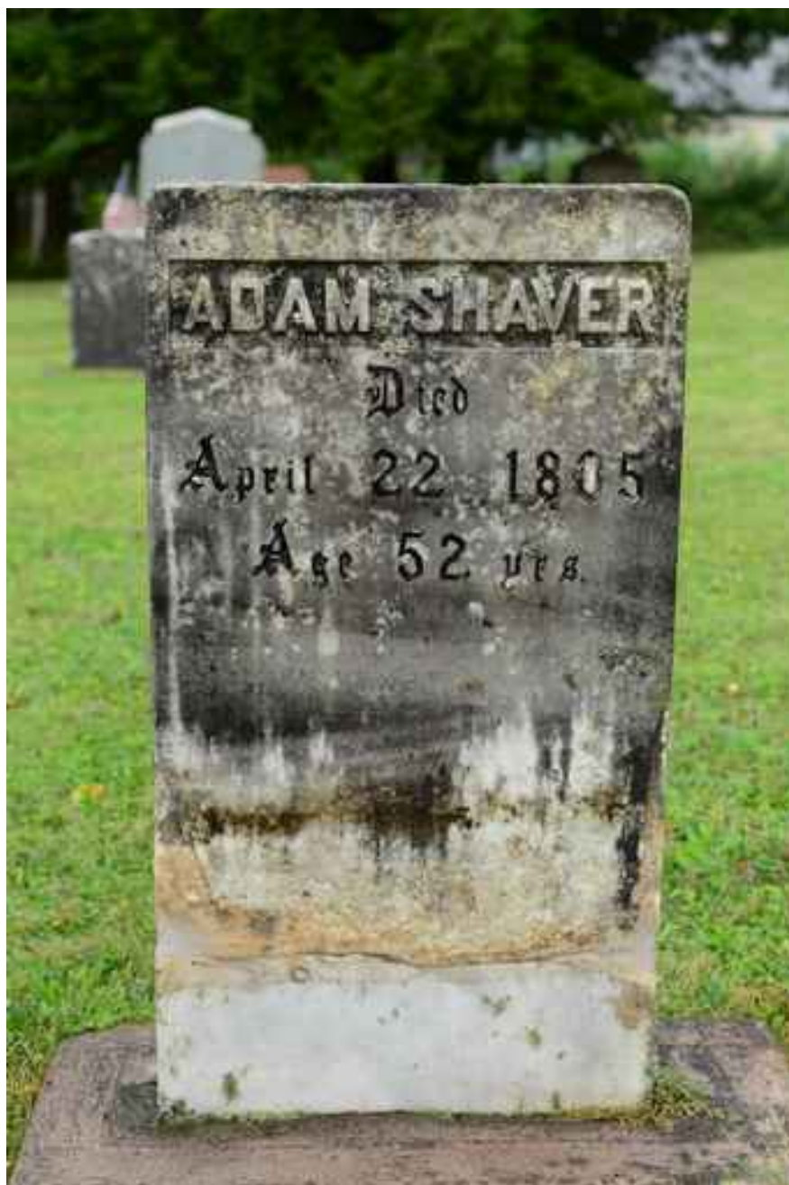
Figure 7, Gravestone of Adam Shaver in New Shavertown Cemetery.