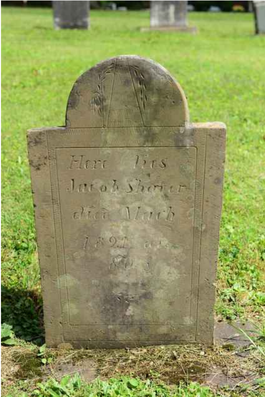
Figure 4, Gravestone of Jacob Shaver in the New Shavertown Cemetery.